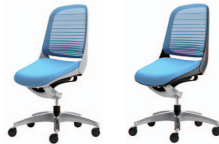
Frame Color : White