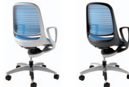
Frame Color : White